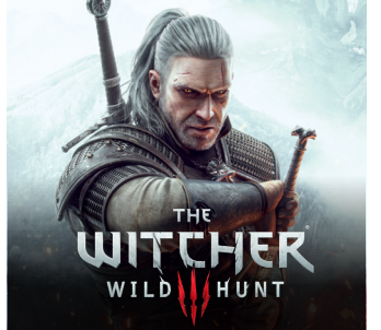
2015 - PC, Xbox One, PS4 2019 - Nintendo Switch 2022 - Xbox Series XIS, PS5

Honest and direct communication with gamers. Full control over the