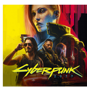
2020 - PC, Xbox One, PS4, Stadia 2022 – Xbox Series XIS, PS5