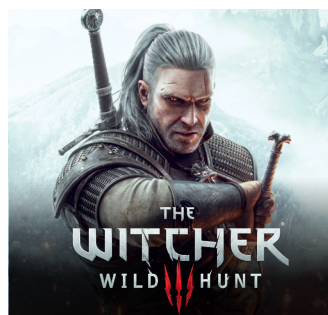
2015 – PC, Xbox One, PS4 2019 – Nintendo Switch 2022 – Xbox Series X|S, PS5