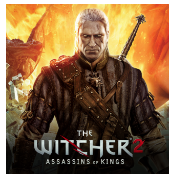
2011 – PC 2012 – X360