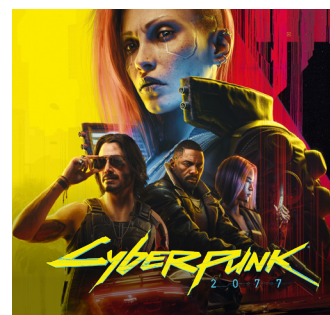
2020 – PC, Xbox One, PS4, Stadia 2022 – Xbox Series X|S, PS5