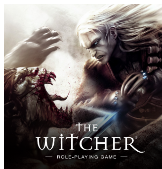
2007 – PC